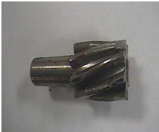
250723 PINION GEAR