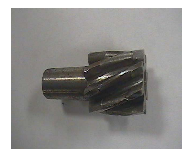
250723 PINION GEAR